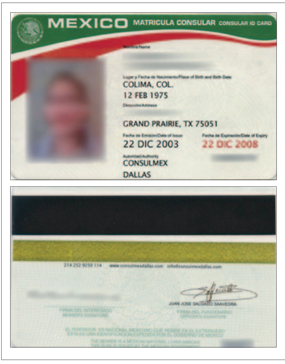
Figure 4: Sample of High-Security Mexican CID Card