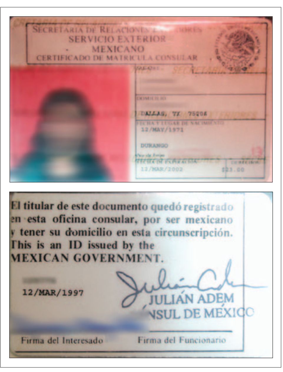
Figure 3: Sample of Laminated Mexican CID card

now in circulation. Prior to that assessment, in March 2002, Mexico began phasing in a new CID card that incorporates various technical security features not contained in the older version of the card (See fig. 4.) This newer card is considered by Mexican officials to be a high-security CID card, compared with the low-security CID card issued earlier.