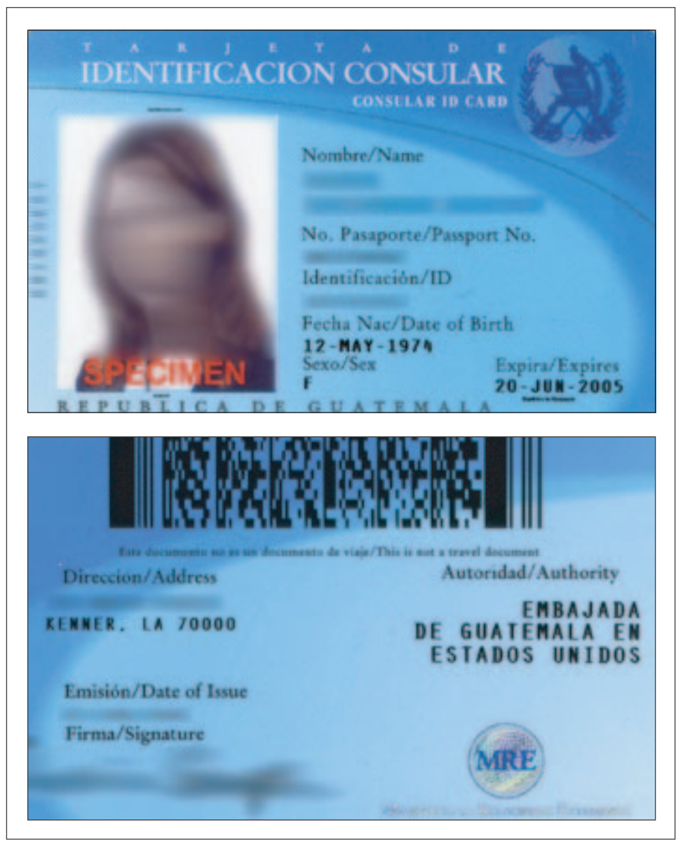
Figure 5: Sample Guatemalan CID Card